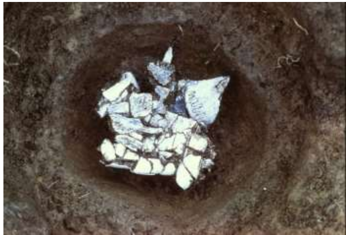
The bones which were put into the box and buried.

We found bones, coins, the beads of rosary, charcoal, nails and so on in the hole (diameter 1m depth 20 cm). The cross shaped grooves are the traces of the cremation facilities. After cremation, they were buried immediately and collected bones were also put into the box (30 cm square) for burial.