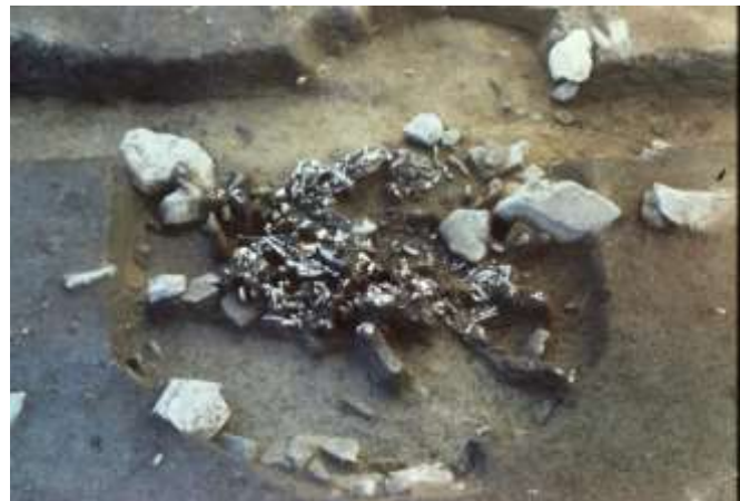
Discovery location of No.125 tomb