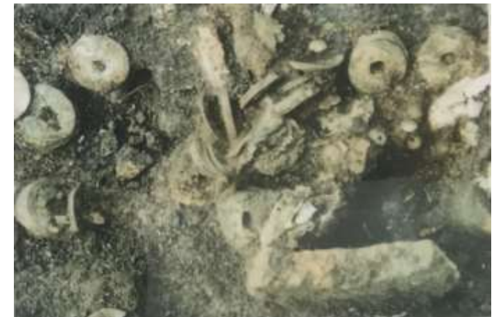
The burned bones, coins and the beads of rosary (No.9 tomb)