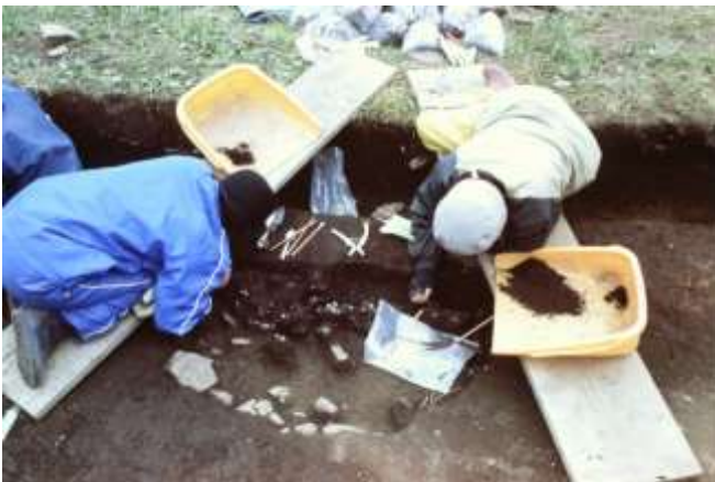
Excavation landscape of No.125 tomb